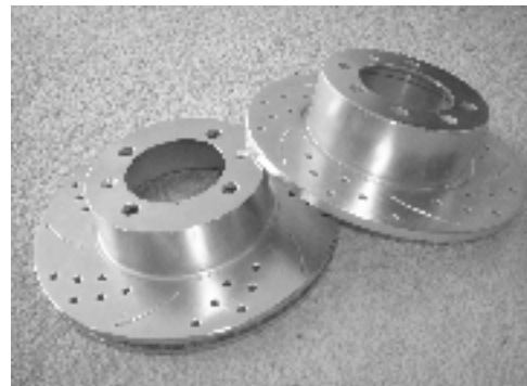
16v 1986 SAAB 900 Aero brake discs shown